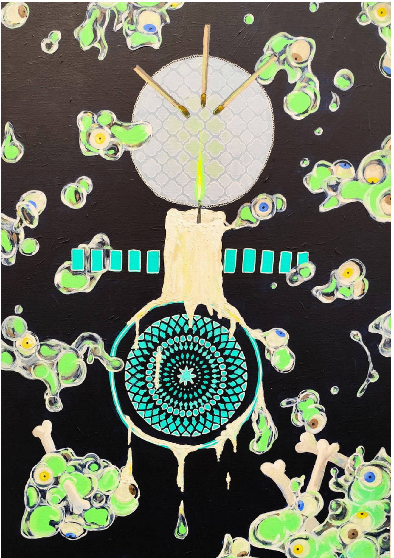
Les aveugles , 2026 Acrylic on canvas, 65 x 56 cm