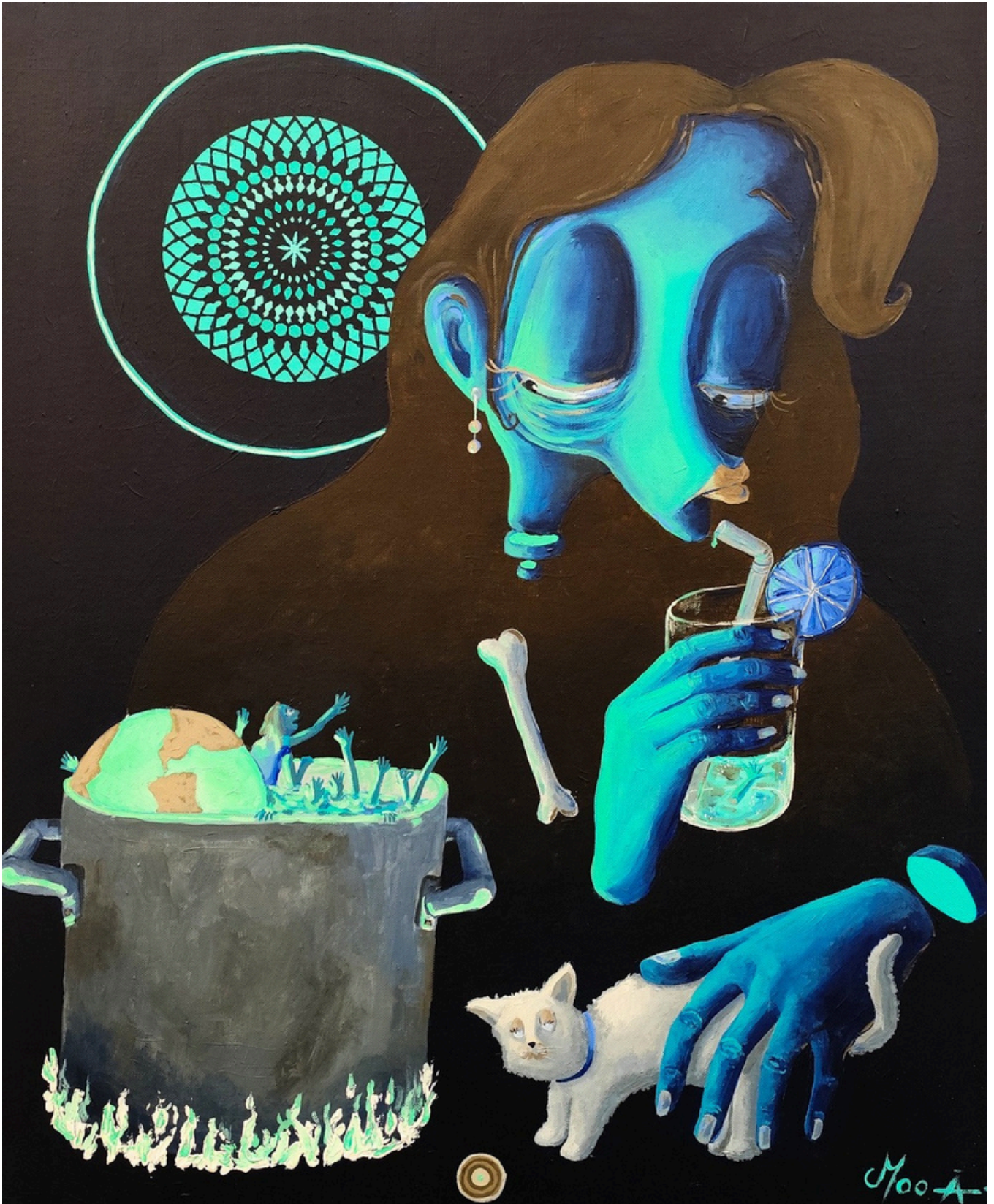
Le goût du mépris, 2025 Acrylic on canvas, 65 x 56 cm